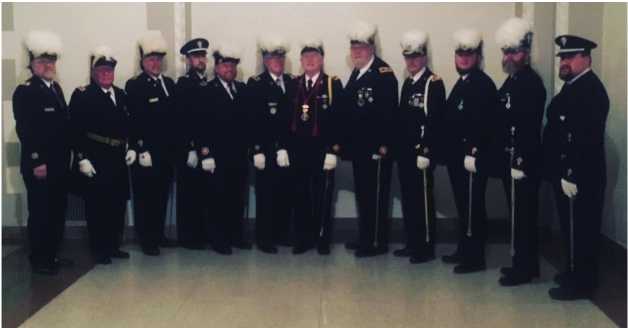
February 9, 2019, At the DeMolay Sweetheart Dance the above Sir Knights formed the lines as the Grand Commander escorted the Distinguish Guest through the lines.