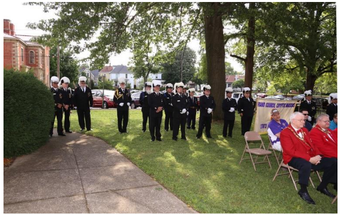
Sir Knights attending the ceremony