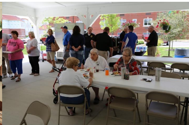
Ole Friends catching-up