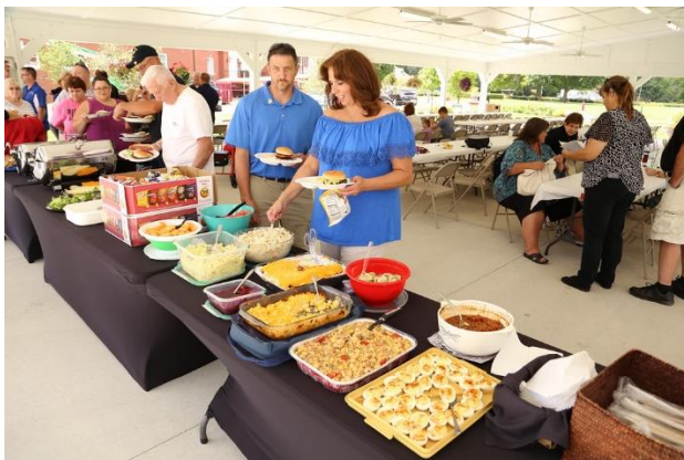
Lots of good food