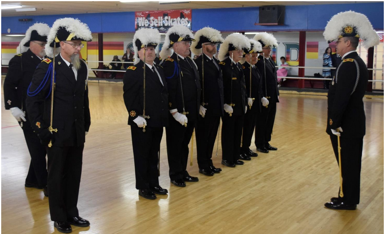
Baldwin Commandery No. 2 Personal Inspection before the Drill