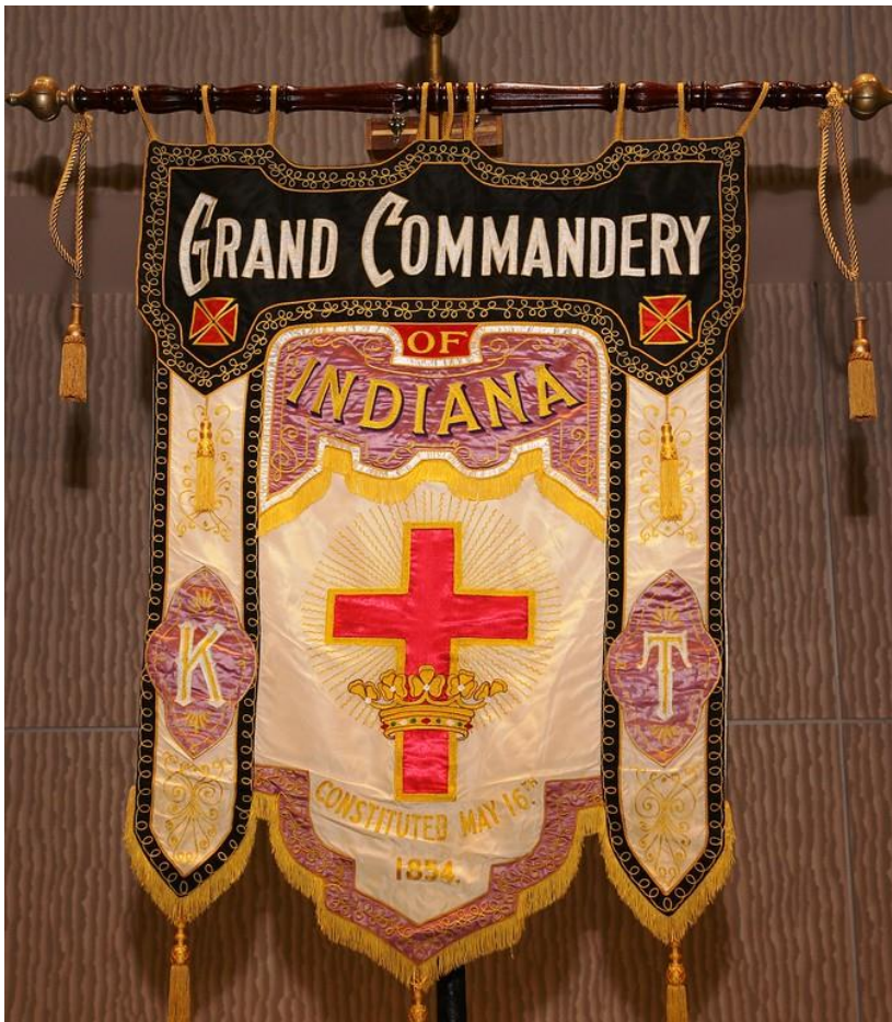
Grand Standard of the Grand Commandery