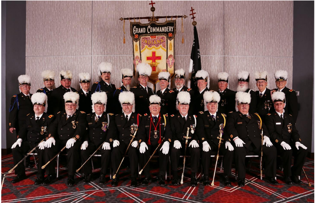
2018 – 2019 Grand Commandery Officers