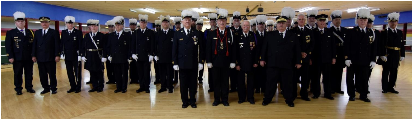
Drill Teams, Inspecting Officers and Grand Officers April 21, 2018