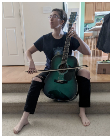
Job's have been posting pictures of their hobbies.