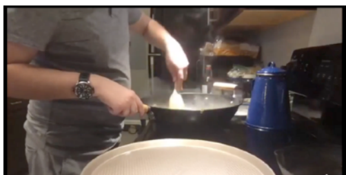
Speedway Demolay is hosting the Quarantine Cafe with a virtual demonstration of how to make a meal.