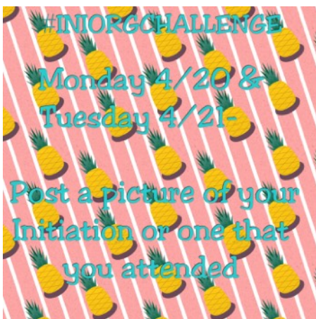
The Rainbow Girls are posting pictures of past events in an online challenge.