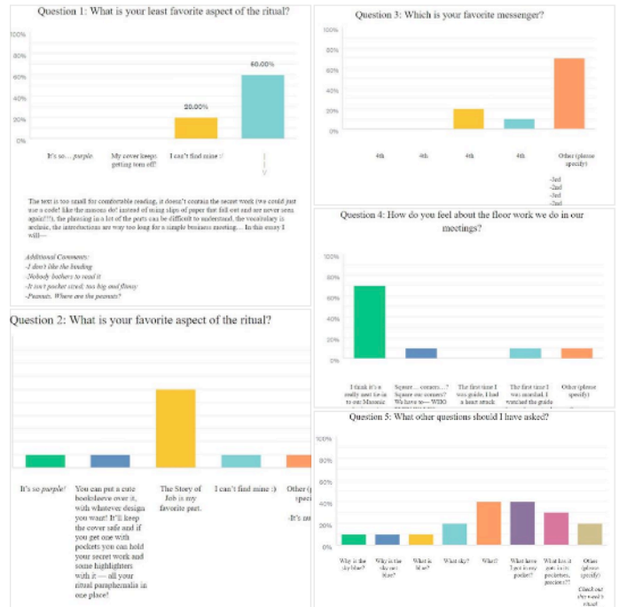
Job's has had fun surveys for its members.