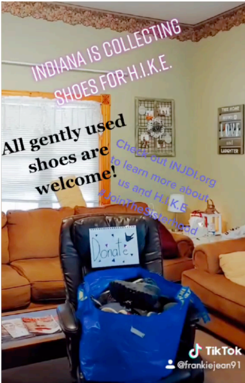
Job's is collecting shoes for HIKE.