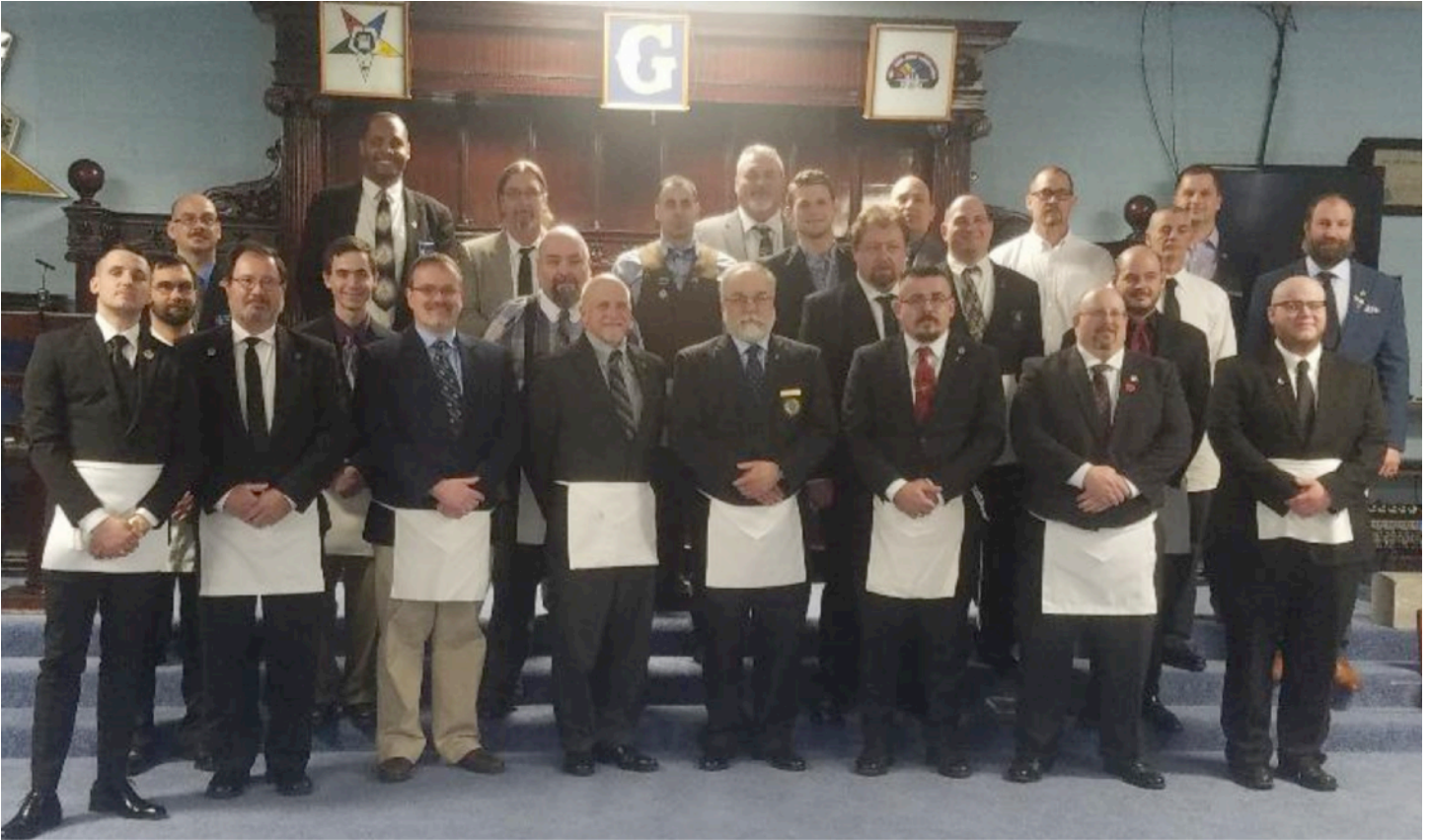
TriState Chapter Council Degrees were held in Michigan City and had 23 candidates.