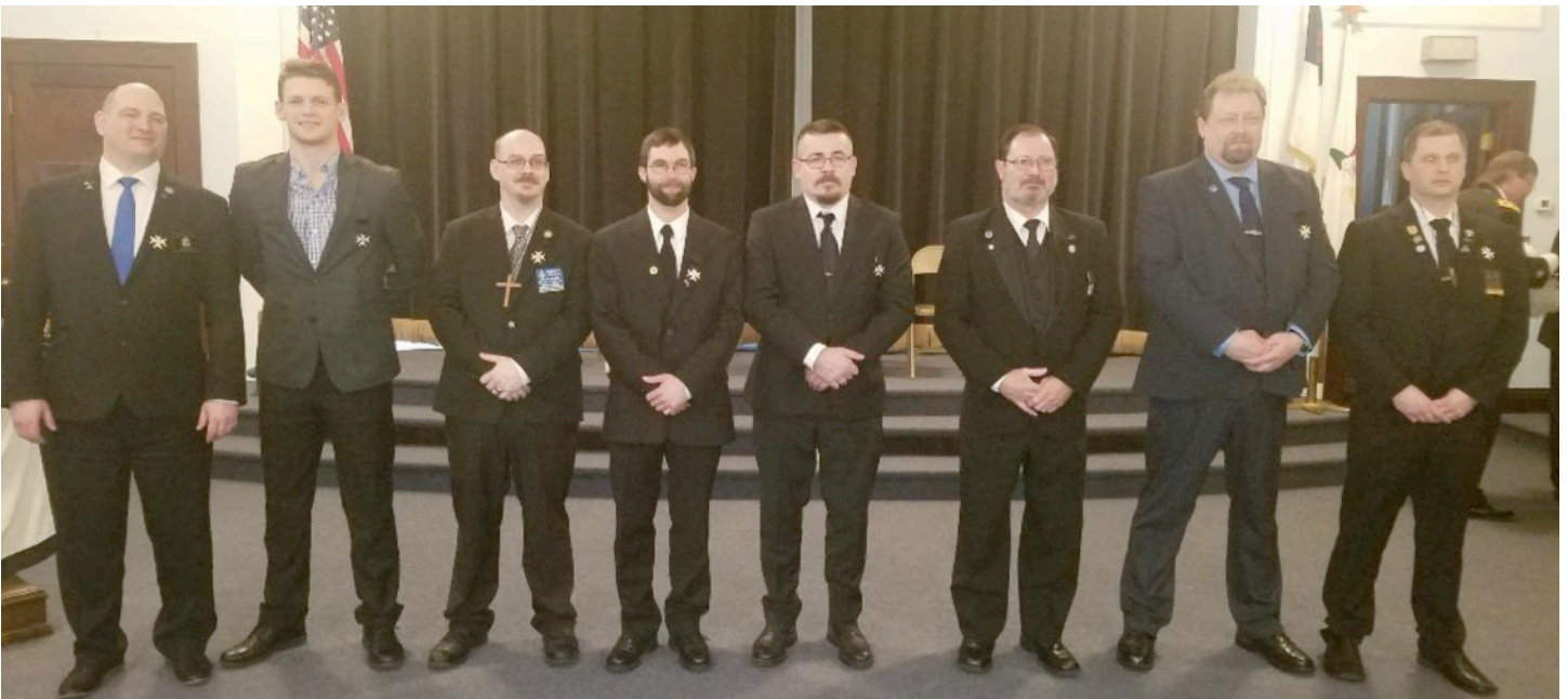
TriState Commandery Orders were held in Ohio with 12 candidates receiving the Orders.