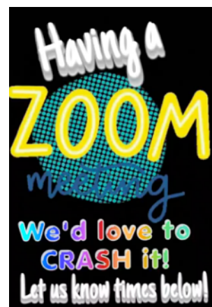
Job;s are visiting on Zoom and inviting other Bethel's to crash their party.