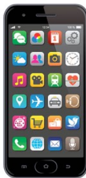
Many people have reached out to each other by text or phone calls.