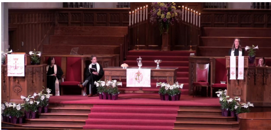
Prather York Rite attended virtual Easter Services at Second Presbyterian Church.

It's been about 6 weeks since the Stay at Home order was issued, 6 weeks since Masonic meetings were last held, and 6 weeks since we've been able to gather in groups. We've see Grand Sessions for Indiana Grand Lodge, all three York Rite Bodies, Job's and many others rescheduled until later in the year. What have you been doing to stay in touch with each other?