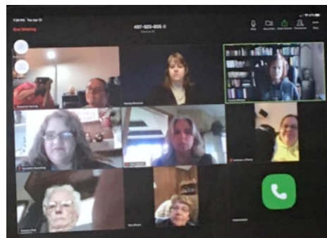
Social Order of the Beauceant #90 is having weekly Zoom meetings, just to say hi.