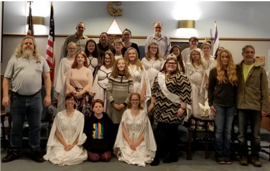
Bethel #22 also came out of Reorganization and Initiated 3 new members. Way to go, girls!