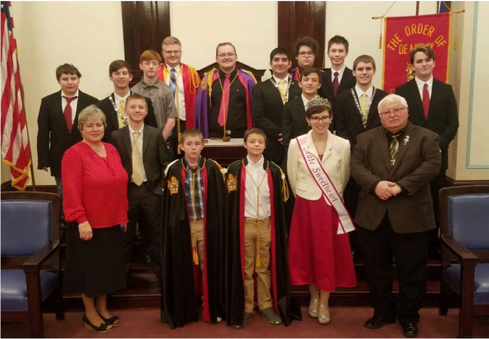
Installation of Officers at the J. McLean Moulder Demolay Chapter in Kokomo.

Congratulations to Speedway DeMolay for their 9th consecutive win at the Indiana DeMolay Wayne M. Reid Memorial State Ritual Tournament Championship!