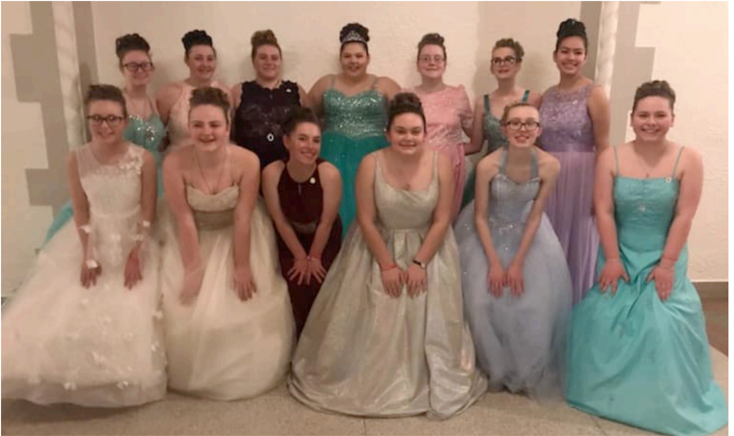
Having fun hanging out at the DeMolay Sweetheart Dance