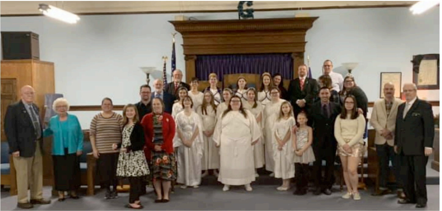
Bethel #44 came out of Reorganization and Initiated 3 new members. Congratulations girls!