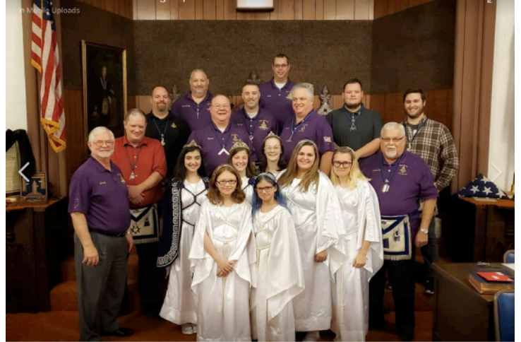
New Haven Lodge #740 F&AM