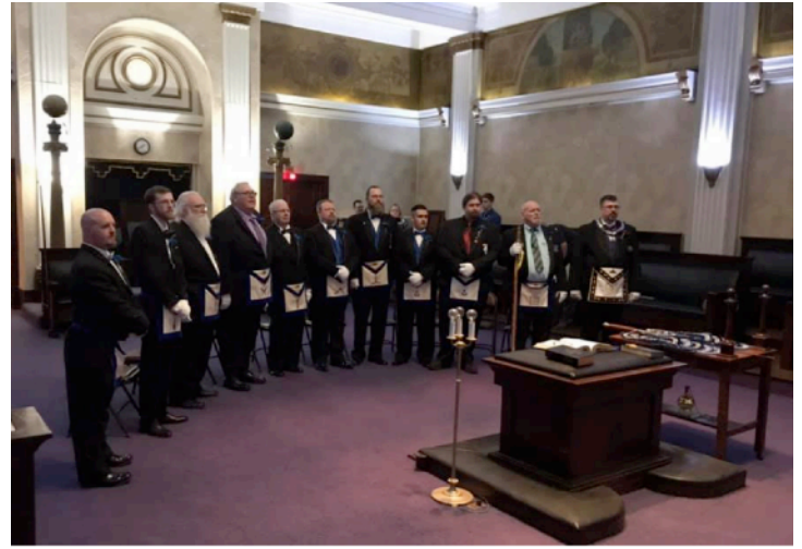
Whiting Lodge #613 F&AM