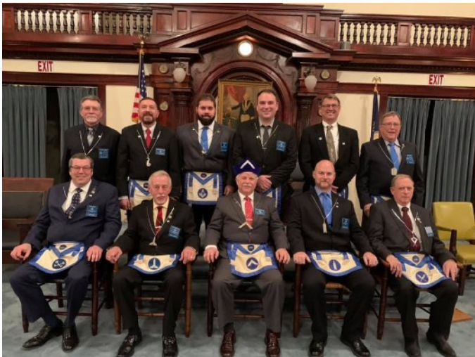
Noblesville Lodge #57 F&AM