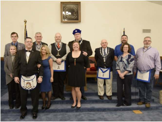
Hamilton Lodge #533 F&AM