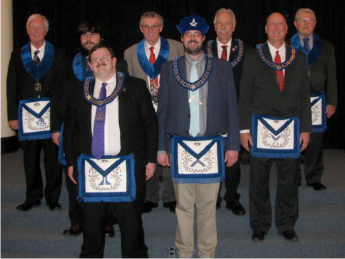
Angola Lodge #236 F&AM