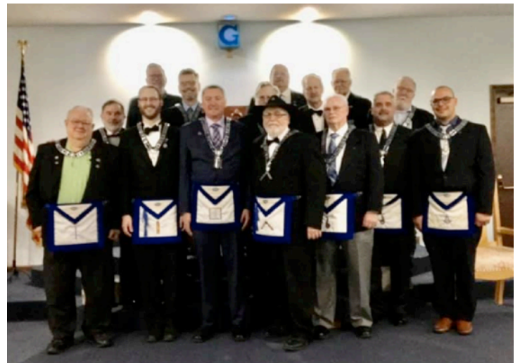
Mishawaka Lodge #120 F&AM