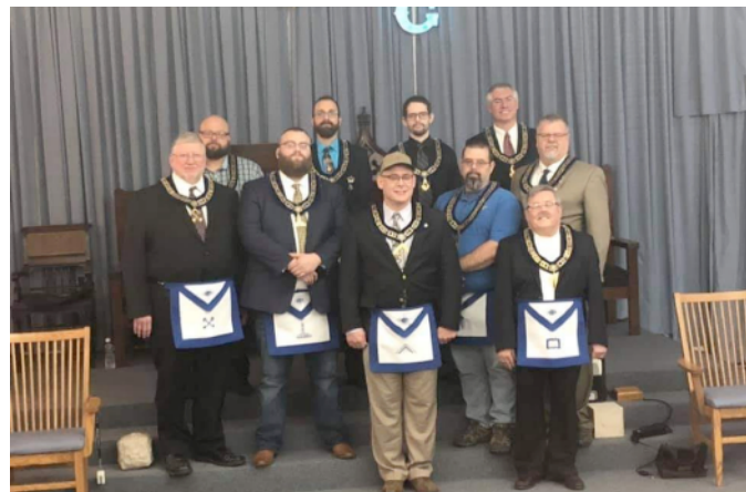
George Washington Lodge #325 F&AM