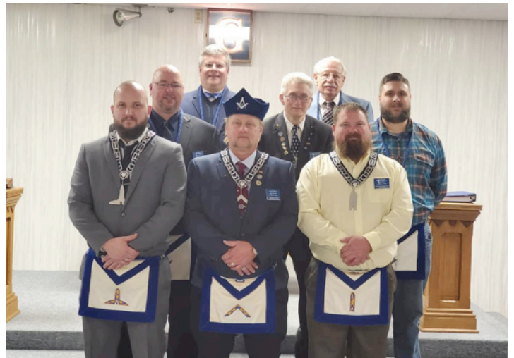
Madison Lodge #44 F&AM