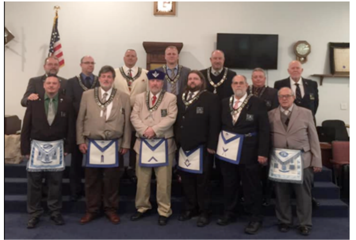
Greenwood Lodge #514 F&AM