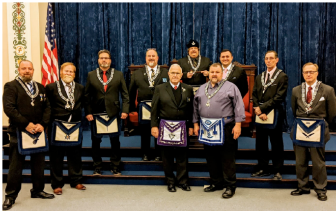
Shelby Lodge #28 F&AM