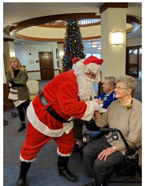
Indiana Rainbow Grand Officers annual Christmas visit at Compass Park-IMH on December 7th.