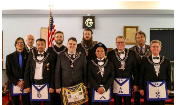
Carmel Lodge #421 F&AM