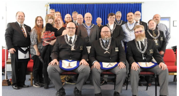
Jubilee Lodge #746 F&AM