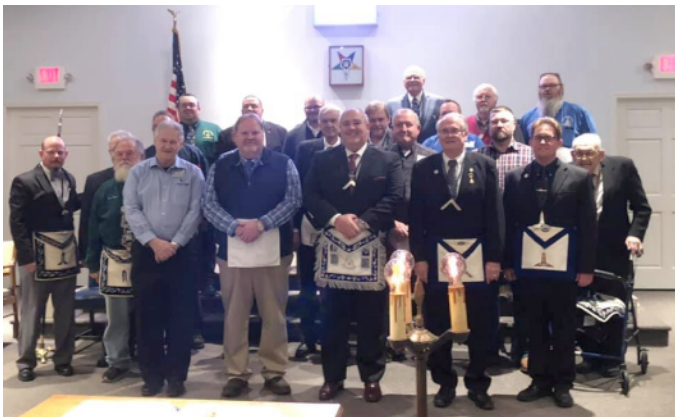
Webb Lodge #24 F&AM Whitewater Lodge #159 F&AM Richmond Lodge #196 F&AM Joint Installation