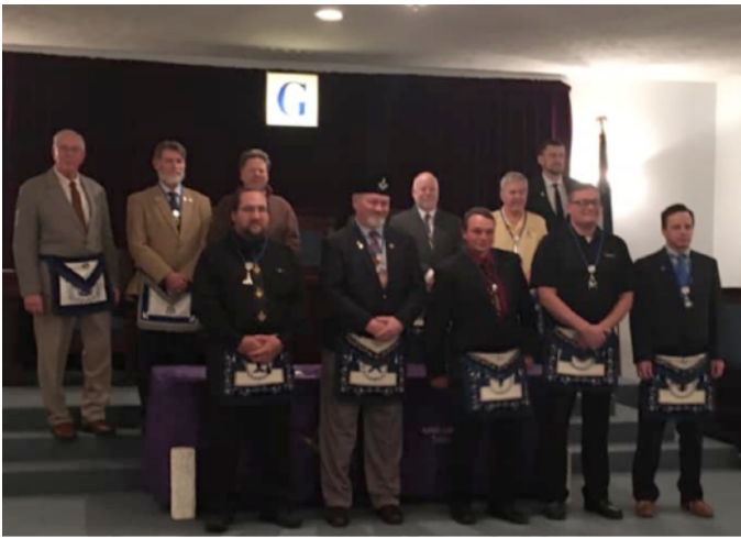
Austin Lodge #128 F&AM