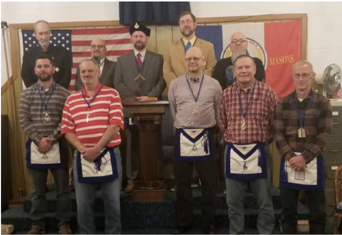
Rising Sun Lodge #6 F&AM