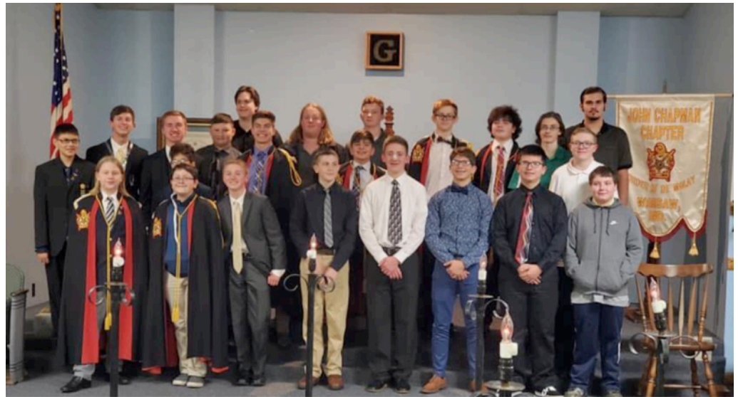
Installation of Officers at the John Chapman DeMolay in Warsaw.