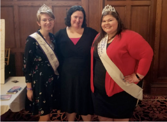
Job's Daughters booth at Founders Day