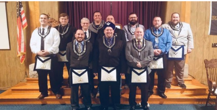
Martinsville Lodge #74 F&AM