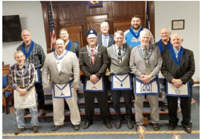
Tipton Lodge #33 F&AM