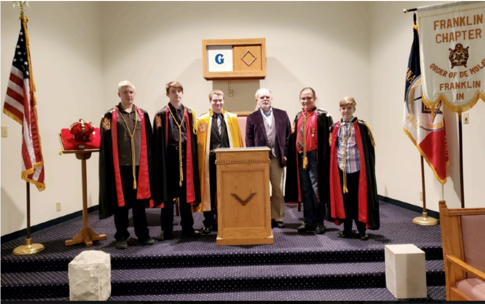
Installation of Officers at the Franklin DeMolay.