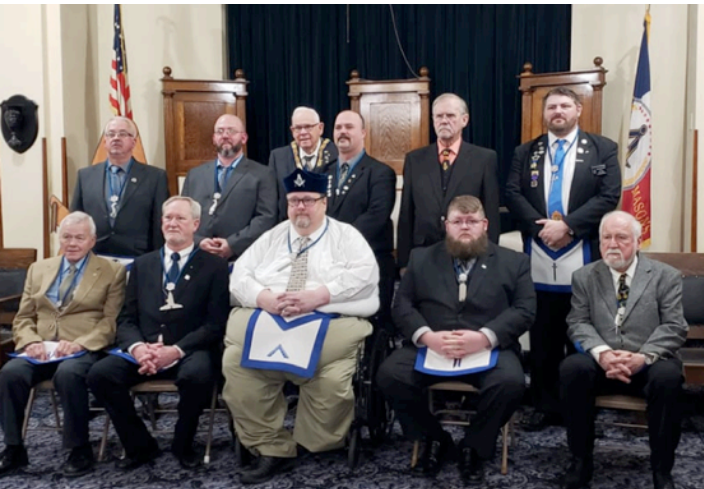
Peru-Miami Lodge #67 F&AM