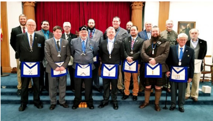
St. Johns Lodge #20 F&AM