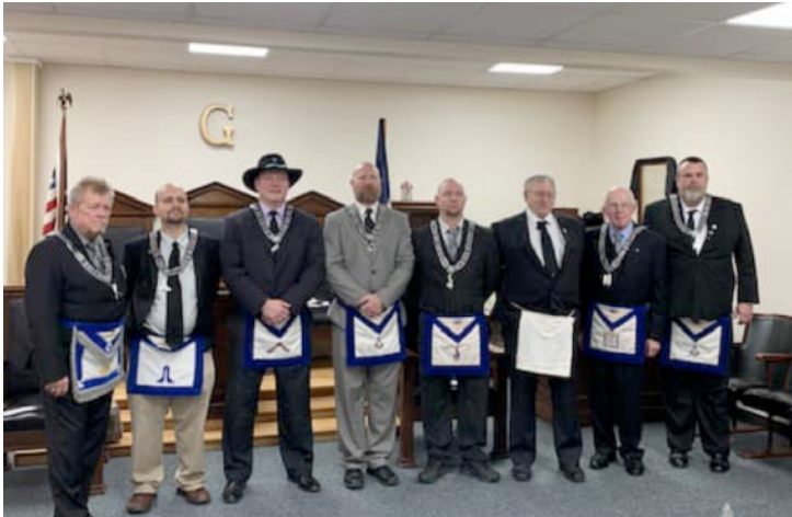
Amity Lodge #483 F&AM