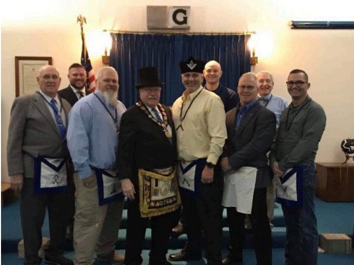
Union Village Lodge #545 F&AM