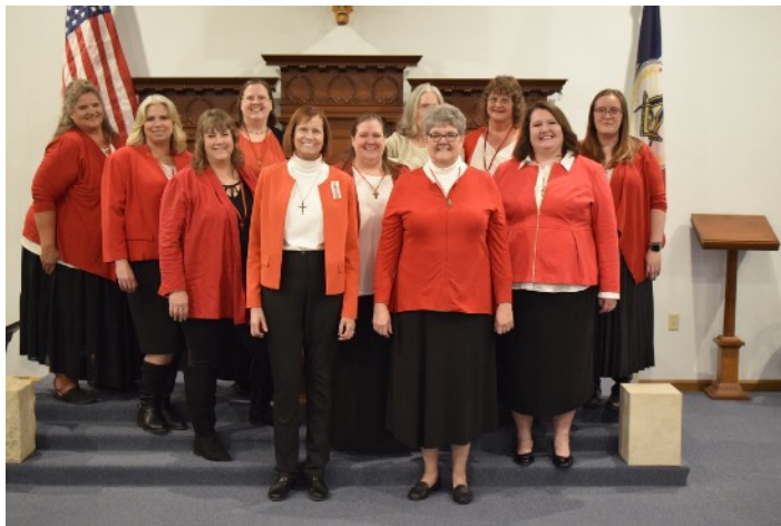
Social Order of the Beauceant #90