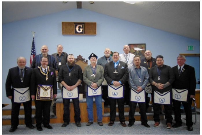
Cloverdale Lodge #132 F&AM