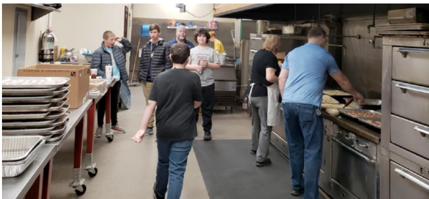
Speedway DeMolay making breakfast for over 200 Masons on Founder's Day.