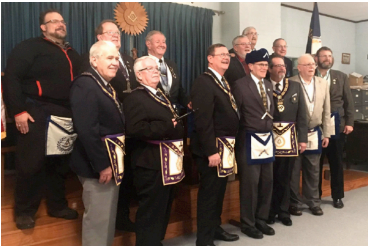
Vesta Lodge #136 F&AM