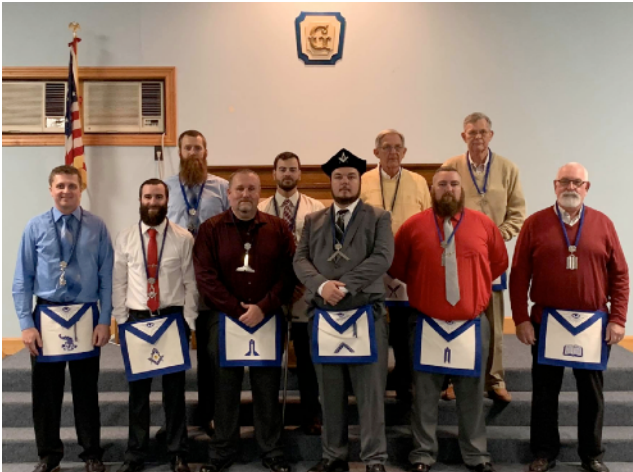
Linton Lodge #560 F&AM