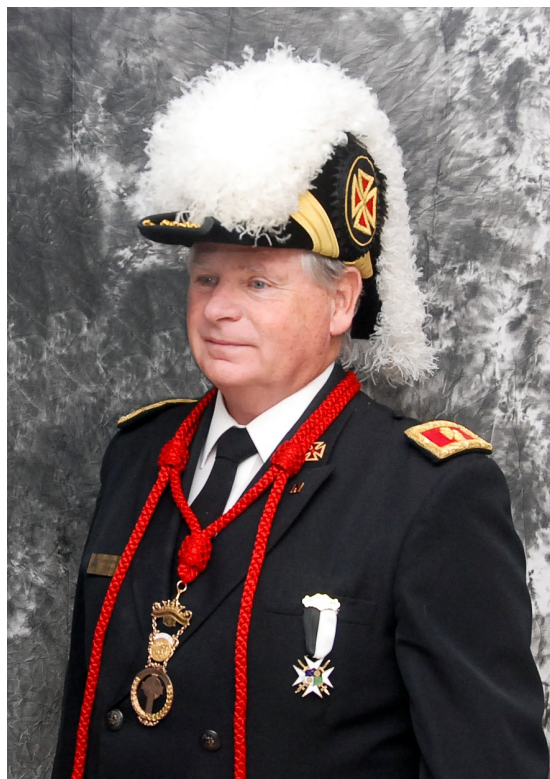
Grand Commandery Officers 2015 - 2016